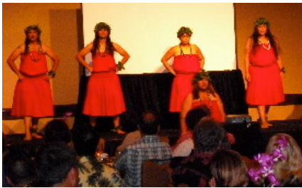
INSIDE: 2nd annual dinner benefit recap and much more!